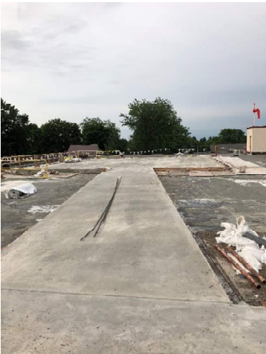
The forms were stripped from the helipad, revealing the final concrete product.