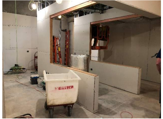
The photos above depict the new Outpatient area. The left photo is looking west down the hall, the center photo is the nurse station, and the right photo is the registrar area. The next step of construction is to tape and finish the walls so they are ready for paint.