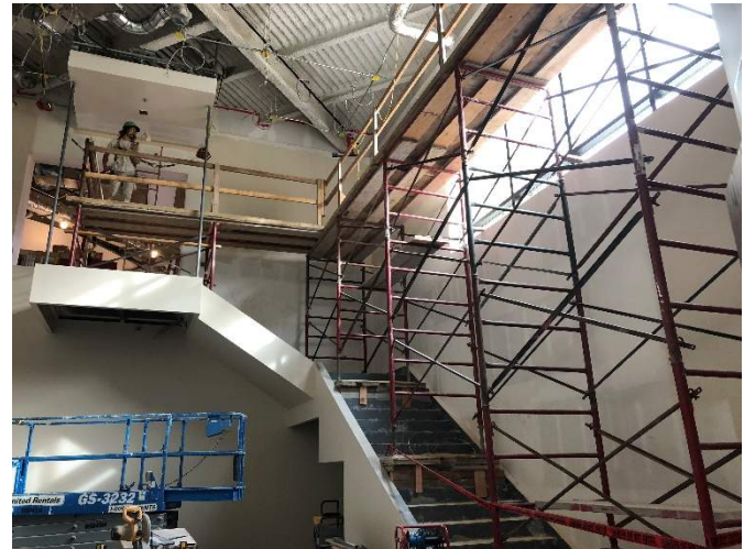
A scaffolding system was installed on the grand stair to allow finishes of hard to reach areas, such as the paint, to be safely completed.