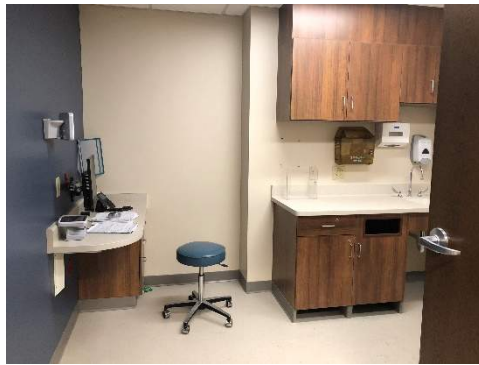
A view of an exam room in the lower level Clinic / Med Surge addition. The owner supplied items are currently being installed.