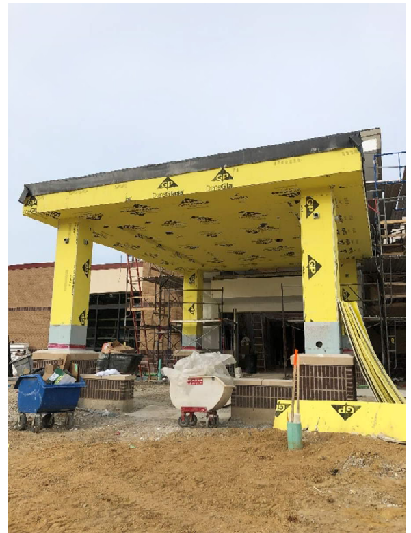
A view of the new canopy going into place. The yellow material is DensGlass sheathing which is a water resistive barrier.