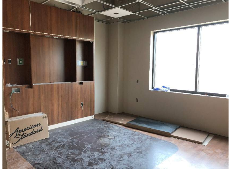
Various views of the progress taking place in the upper level Clinic / Med Surge addition. The nurse servers are being installed as well as the flooring. The final items to be completed is trimming out the MEPs, floor base, and dropping ceiling tiles.