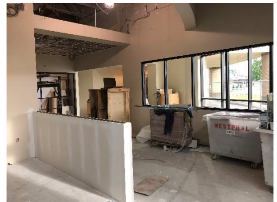
The photos from left to right above are the views you would see if you entered the new front canopy and walked north down main street. The first photo is where the front registration desk will go, the second photo is a view down mainstreet (notice the fireplace location has been framed out), and the last photo is the north end of mainstreet near the giftshop. The walls are up, painting is finishing out, and ceiling grid is being installed.